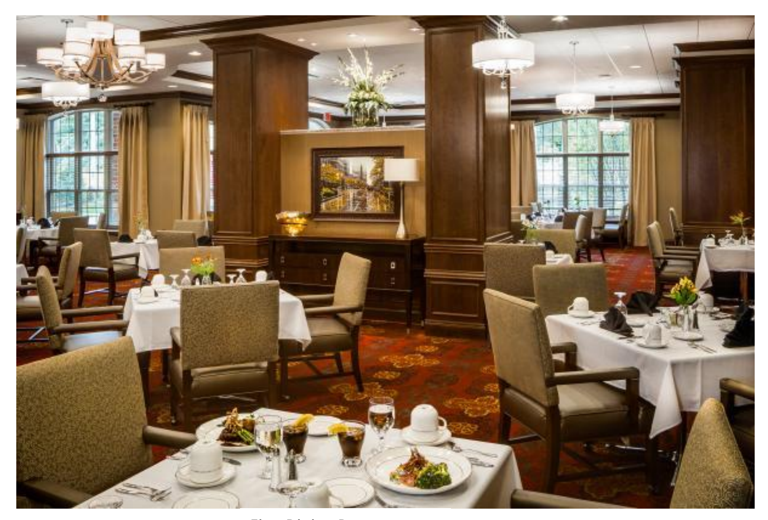
Fine Dining Restaurant