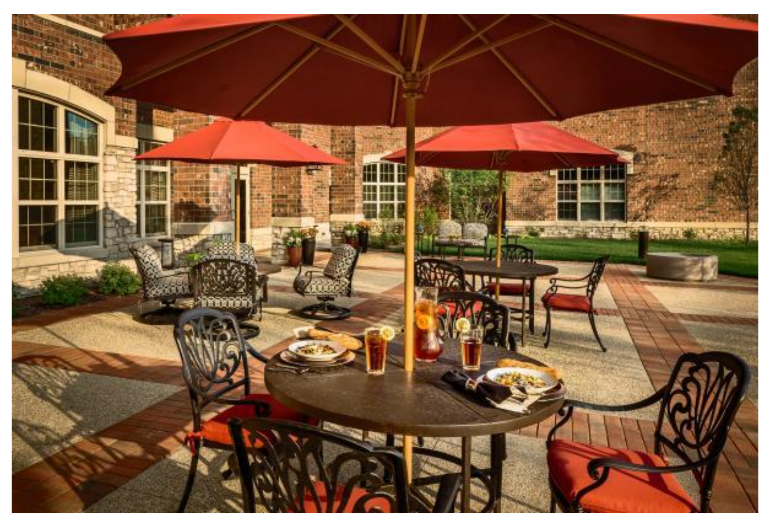
Outdoor seating area