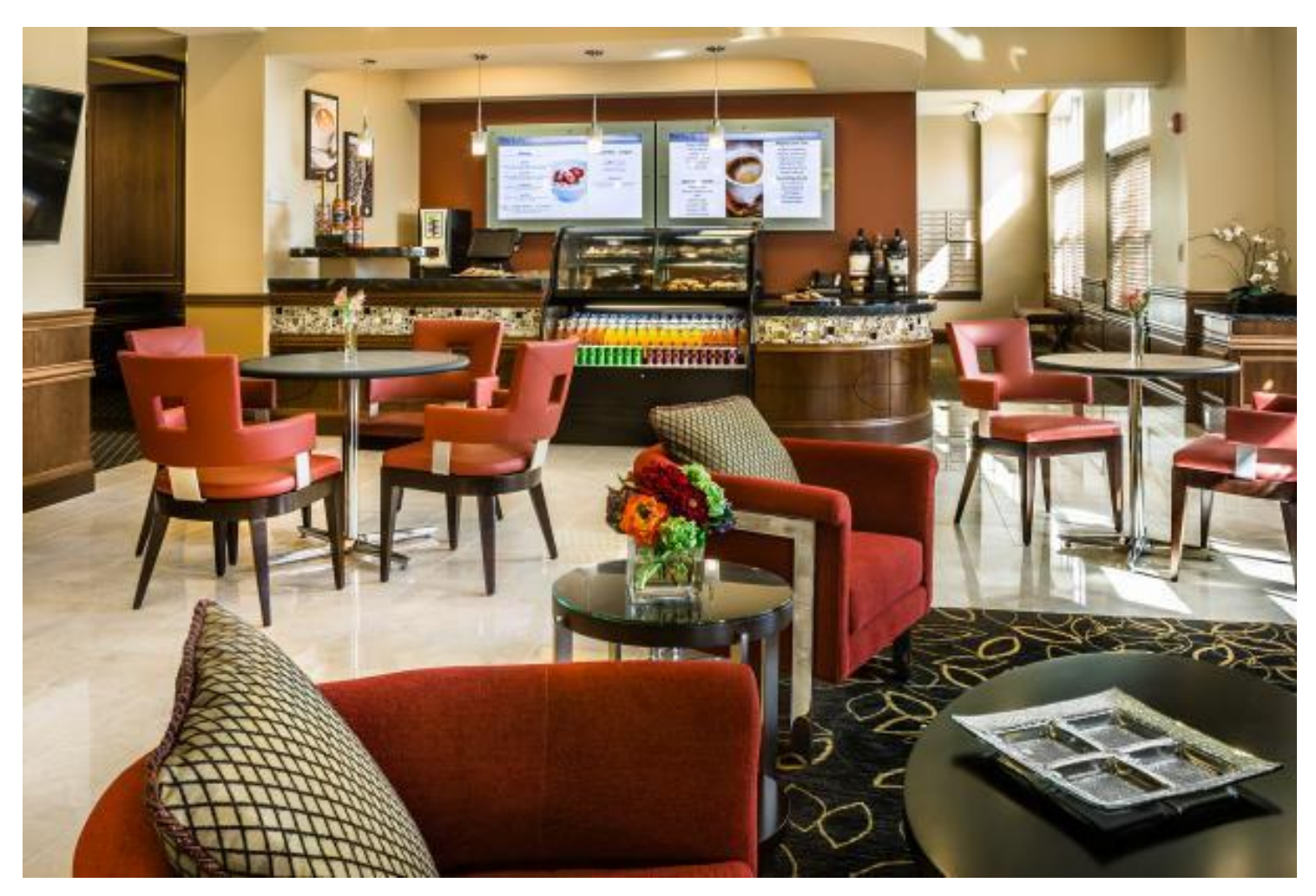
Café available all day