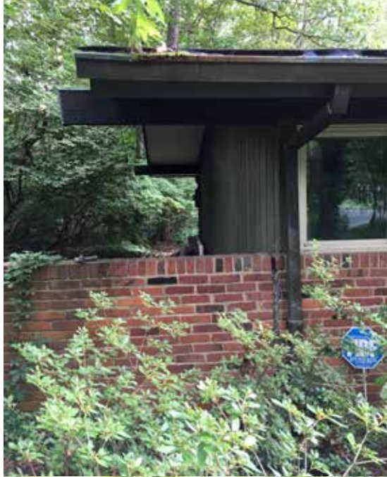
Tuckpoint and Repair Existing Brick