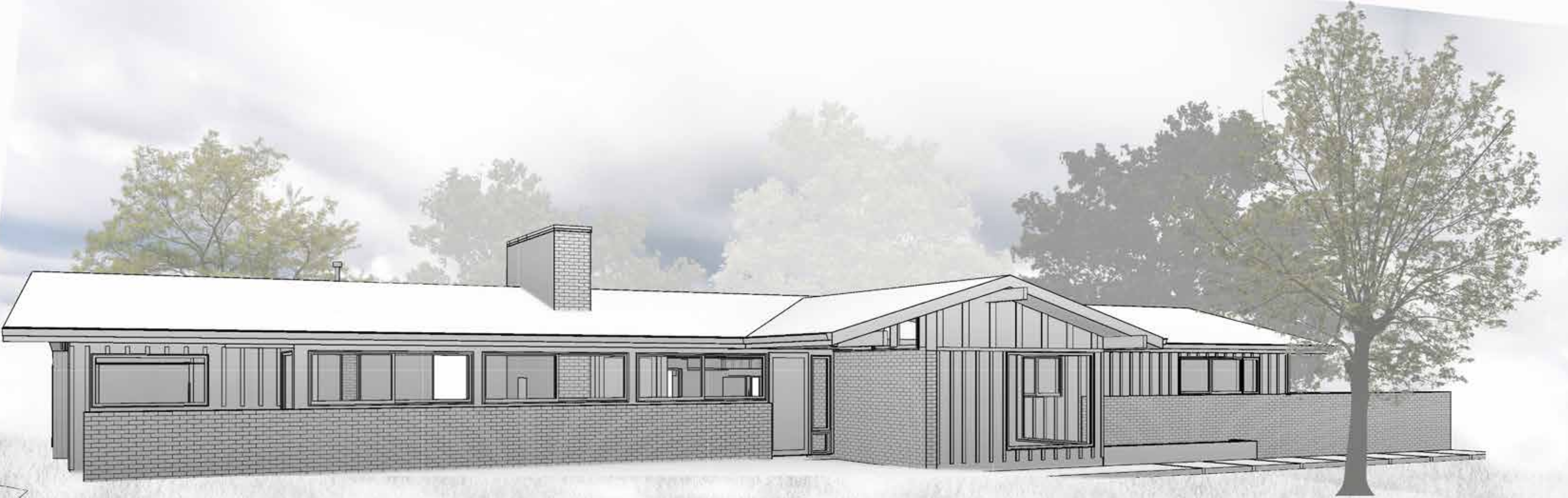
VIEW FROM FRONT