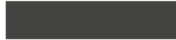
Fascia and Exposed Beams Color James Hardie Cement Fiber