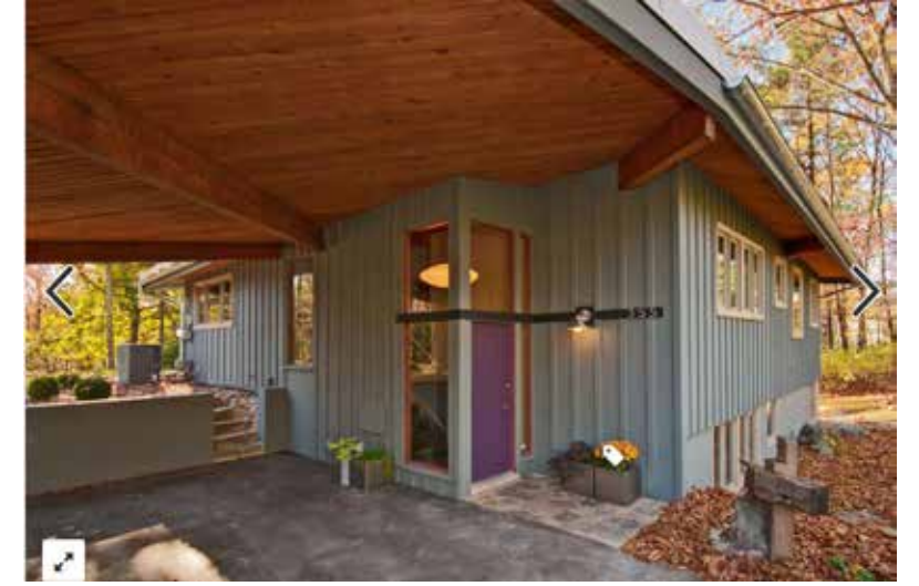
Sample Cement Fiber Board and Batten Installation