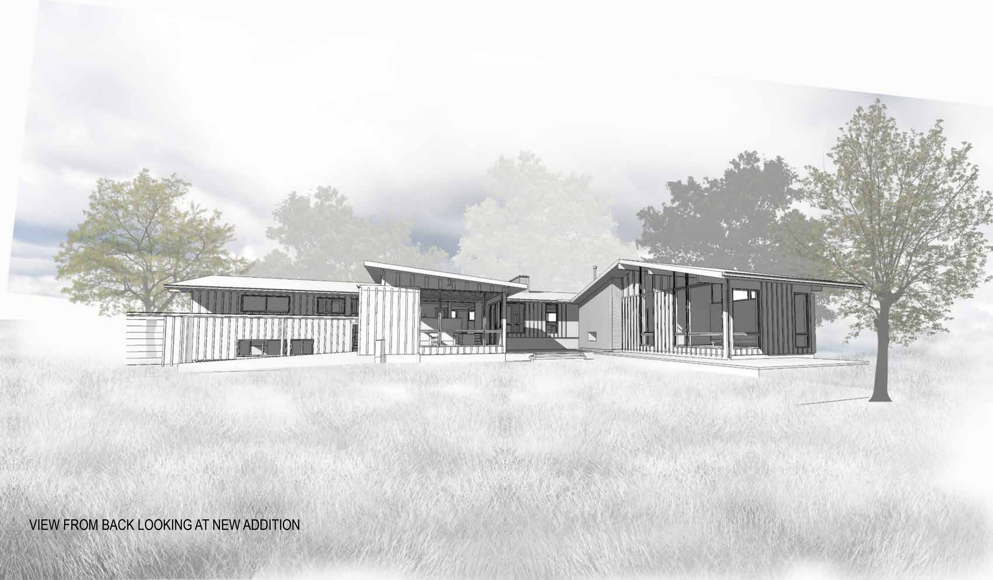
VIEW FROM BACK LOOKING AT NEW ADDITION